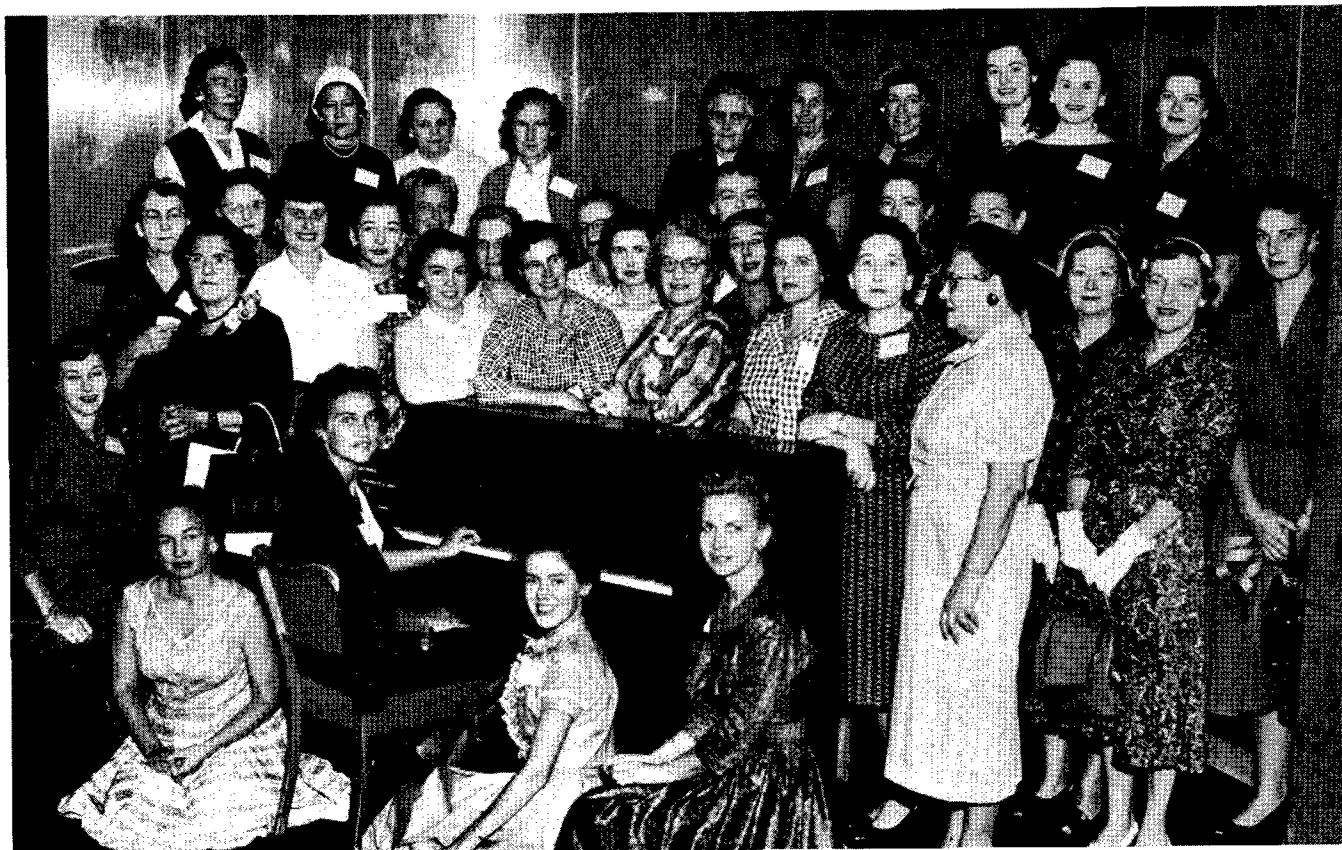
AROUND THE PIANO —Bright and early on Tuesday morning, the ladies in attendance at the 33rd annual fall meeting of the American Oil Chemists' Society gathered in the New York room at the Statler Hilton hotel for coffee